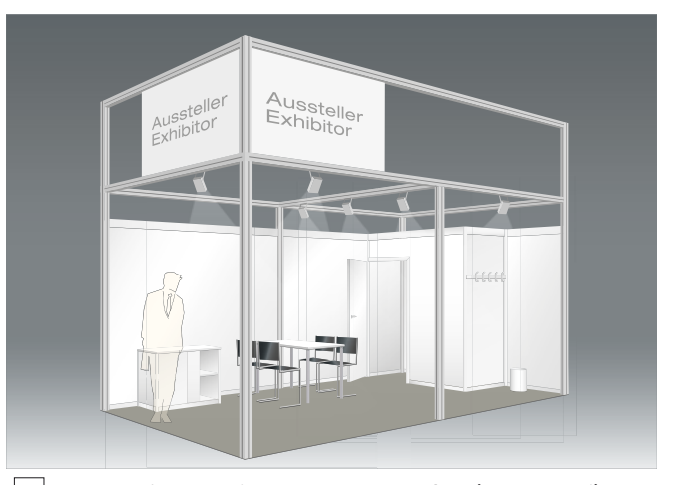
D2 Premium Package, 450.– EUR/m² (row stand)

Messe Düsseldorf GmbH Joachim Schläfke U1 - IFM 40001 Düsseldorf Germany